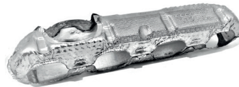
Encapsulation exhaust manifold with perforated and embossed cover material