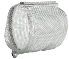
Embossed encapsulation of diesel particulate filter with flapped design, joined with screwing