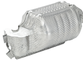
Embossed catalytic converter encapsulation with flapped design, joined with flanging