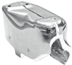
Direct shielding for oxidation catalytic converter

UNDERHOOD | ENGINE ENCAPSULATION | CATALYTIC CONVERTER | EXHAUST MANIFOLD