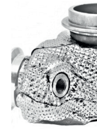
Direct shielding for turbo housing